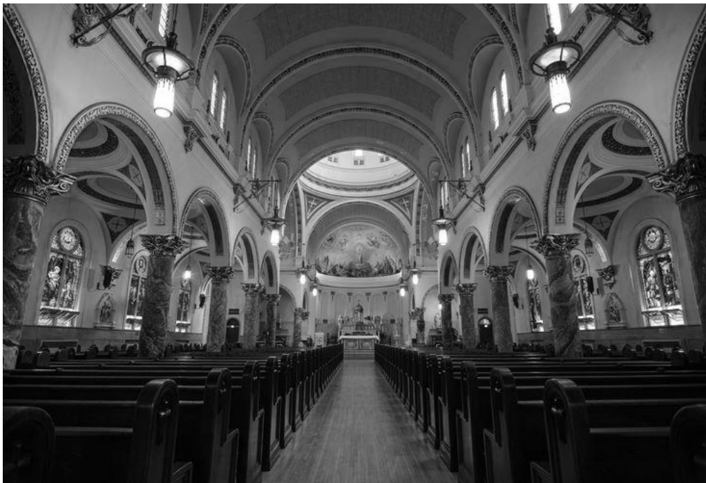
Our Lady of Lourdes Church (4640 N Ashland Ave, Chicago, IL 60640)