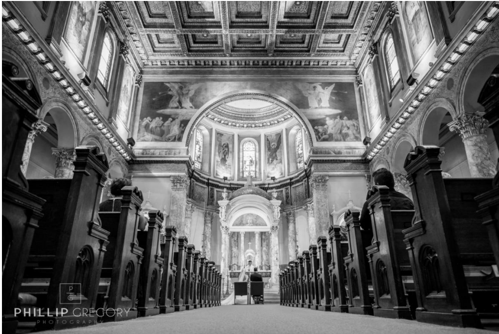
Saint Mary of the Lake Church (4220 N Sheridan Rd, Chicago, IL 60613)